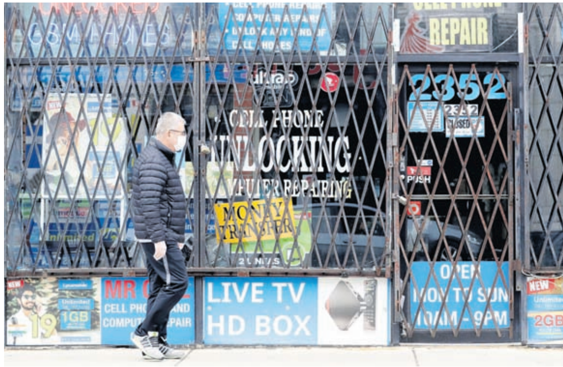
In a April 30, 2020 file photo, a man walks by a closed store during the COVID-19 in Chicago.